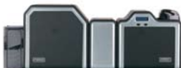
Lamination option and dual-sided printer/encoder